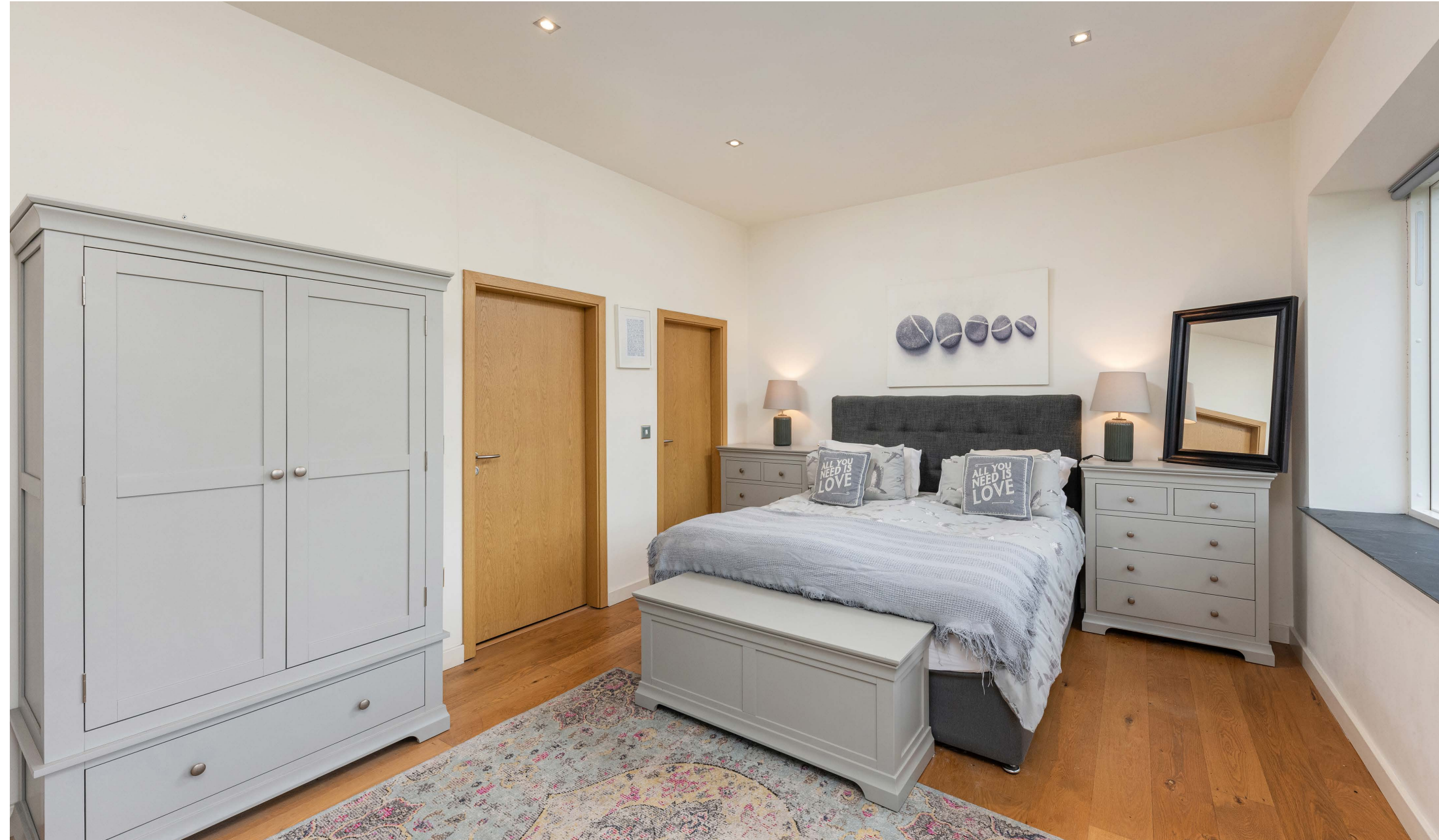
THE OLD SAWMILL