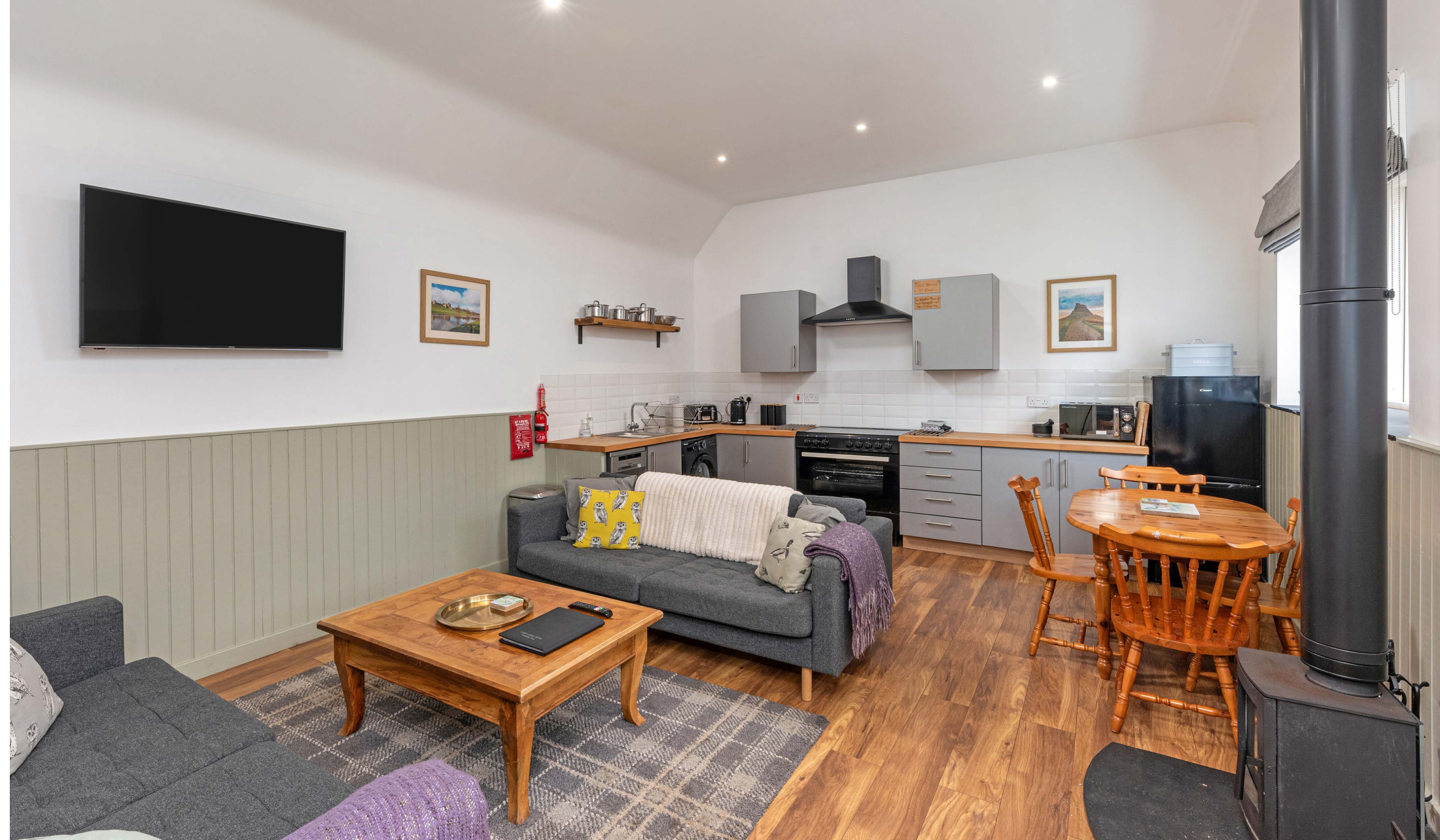
THE OLD BAKERY