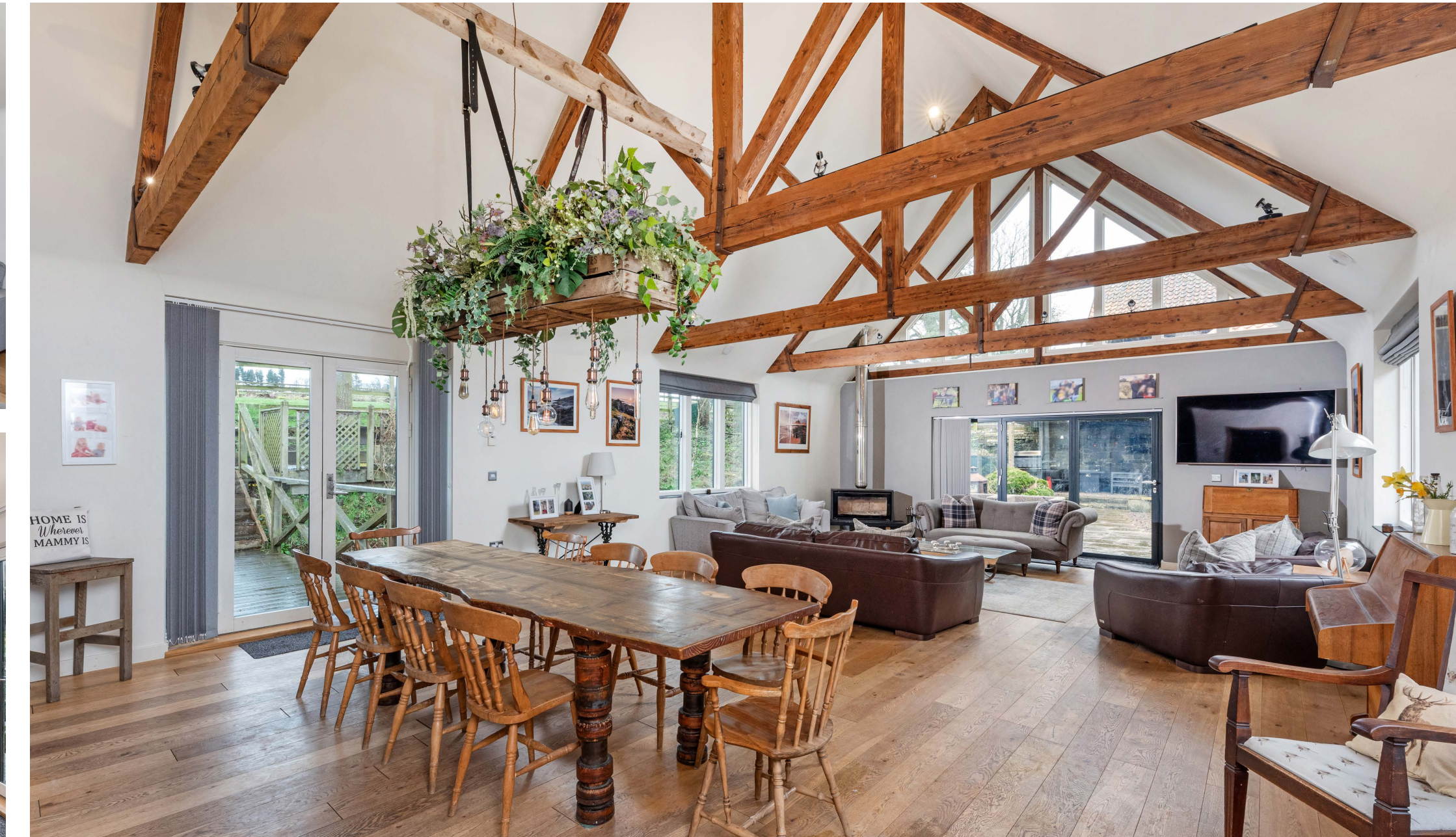
THE OLD SAWMILL